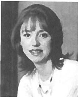
LISA SEE, Author